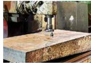
Height determination for milling operation