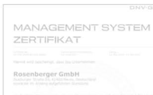
Certifications, third-party approvals