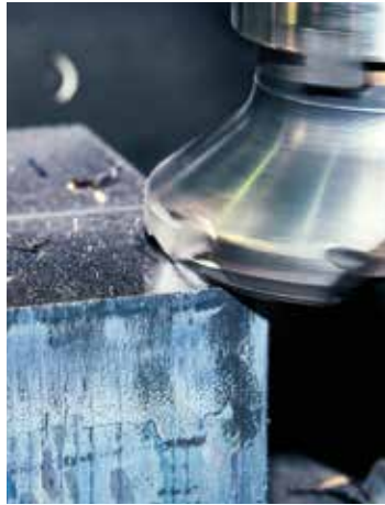
Milling a flat surface