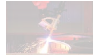
3D plasma/oxy-fuel cutting robot